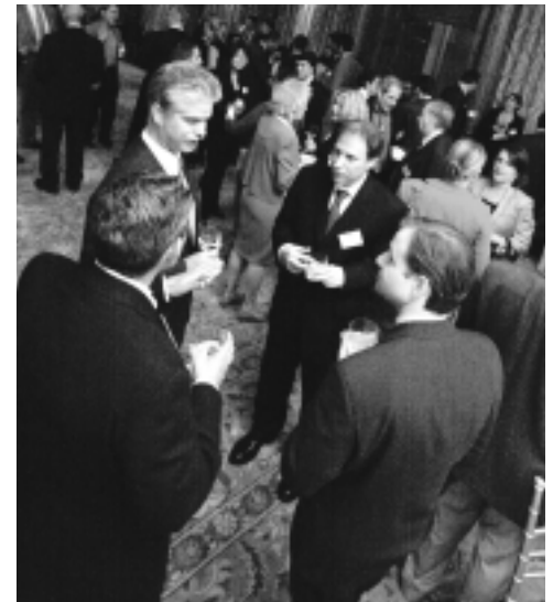
CMC students, alumni, faculty, and staff enjoying an FEI-sponsored cocktail reception at The California Club in Los Angeles